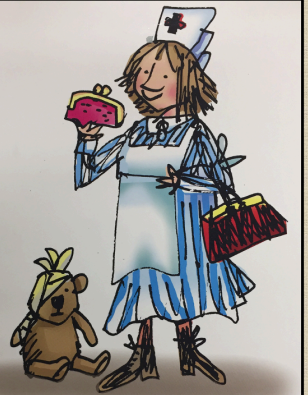
n ur se with a pur se