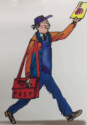
a bett er letter