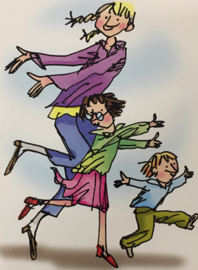
wh ir l and tw ir l